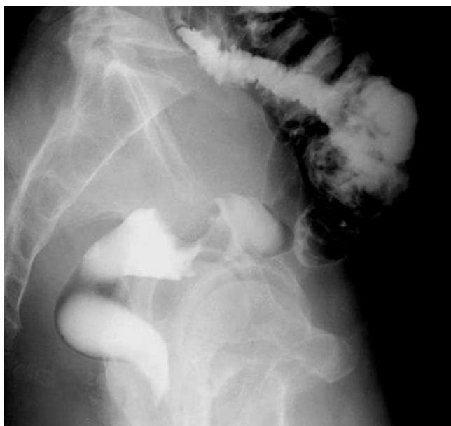
Figure 1 Barium enema revealed an ulcerative tumor in the rectum.

An ulcerated hard tumor was present in the rectum (Figure 2). Histopathological examination revealed that the tumor consisted of large abnormal cells without gland formation and mucin production (Figure 3a). Immunohistochemical studies were positive for cytokeratin and