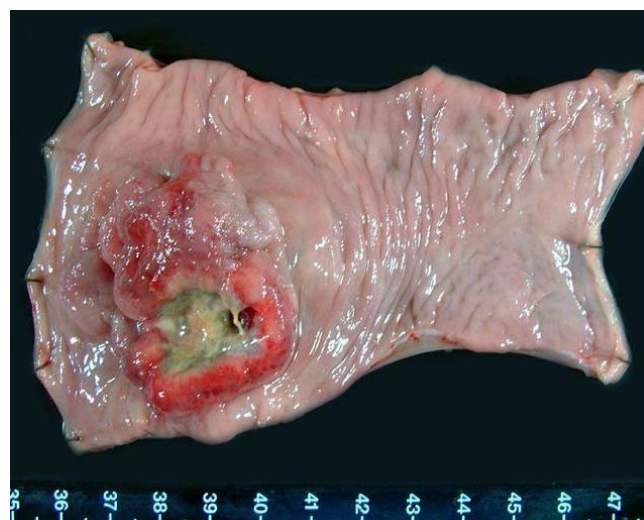
Figure 2 Resected specimen. An ulcerated hard tumor was present in the rectum.