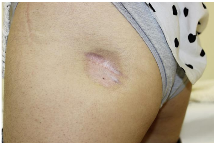
Fig. 2. An atrophic, oval and plaque-like lesion symmetrically localized on the left thigh.