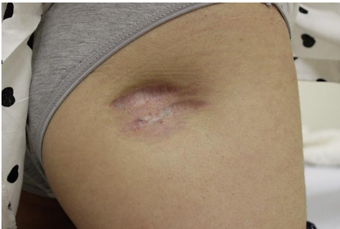
Fig. 1. An atrophic, oval and plaque-like lesion symmetrically localized on the right thigh.