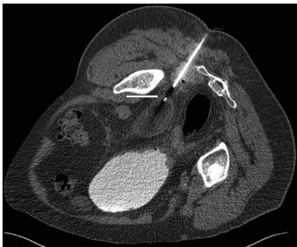
Fig. 3 – Axial section of non-contrast CT scan showing transgluteal, core needle biopsy (white arrow) of fat containing pelvic mass.

be related to previous hemorrhages [6]. Reported observations suggest that EAMLs have less fat content than adrenal myelolipomas and are less likely to contain calcifications [19]. Presacral myelolipomas can be particularly difficult to differentiate from other retroperitoneal masses too. The presence of fat density on CT imaging usually leads to malignant retroperitoneal tumors with fatty content as the main differential, the most common retroperitoneal fat-containing tumor being a liposarcoma [16]. Hence, EAMLs can present a diagnostic challenge for radiologists and can be misdiagnosed as liposarcomas.