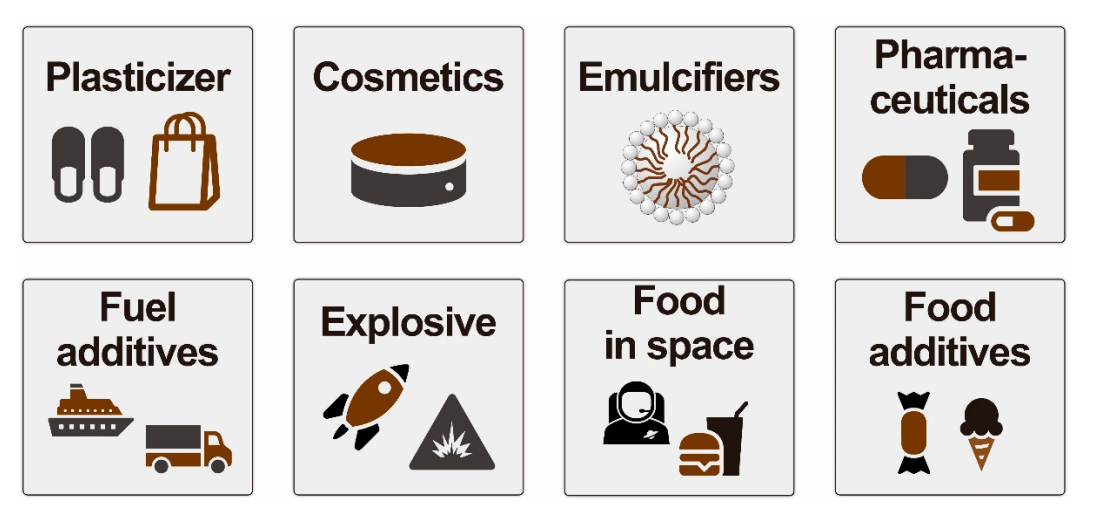
Figure 2. Common uses of acetins.