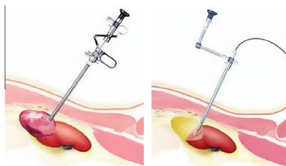
Figure 2 PU of a simple renal cyst using a resectoscope.

The nephroscope was placed adjacent to the cyst in an extra-parenchymal location. A hydro-dissection technique with irrigation fluid (distilled water) was used to make a proper