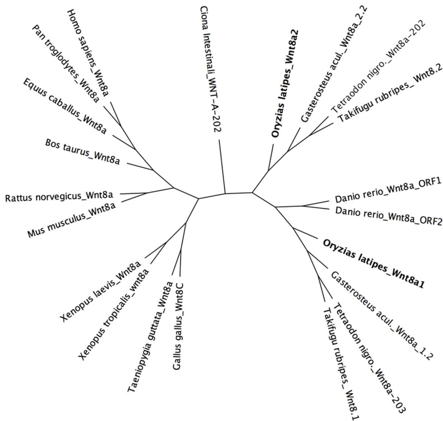
Figure 1. Phylogenetic analysis of Wnt8a genes. The medaka genome contains two Wnt8a genes (bold). The Wnt8a cDNA sequence alignment of various species shows that the medaka paralogous copies cluster well with those of evolutionarily related teleosts. acul., aculeatus; nigro., nigroviridis.