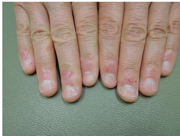
Fig. 5 Distant view of ibrutinib-associated fingernail changes in a 53-year-old man with chronic lymphocytic leukemia. The thin fingernails are fragile and brittle. Drug-induced dermatitis is affecting the distal fingers, including the proximal nailfolds