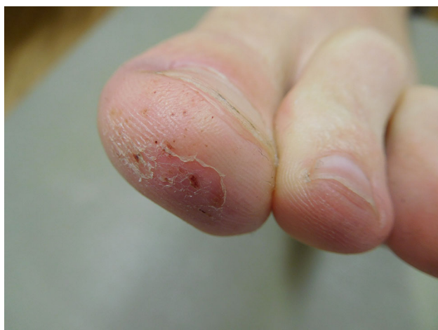
Fig. 8 The distal left great toenail of a 53-year-old man with chronic lymphocytic leukemia. The tip of the toe shows ibrutinib-induced dermatitis presenting as superficial desquamation. There is also hemorrhage in the superficial epidermis presenting as red-brown macules and petechiae

ibrutinib [2–4, 10, 12–14]; less common skin adverse events include purpuric painful nodules and pyoderma gangrenosum [15, 16]. Hair changes associated with the use of ibrutinib include straightening and softening; increased curliness has also been reported [13].