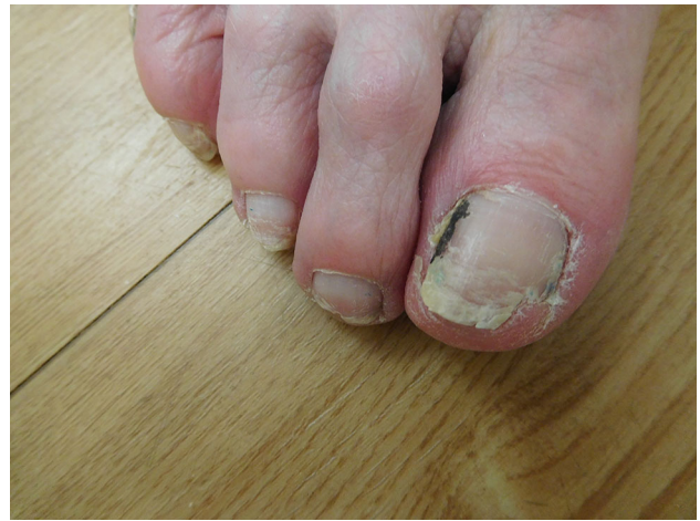
Fig. 2 A closer view of the toenail changes on the right foot of a 79-year-old woman receiving daily ibrutinib treatment for chronic lymphocytic leukemia. The lateral nailfold of the great toe shows a linear black streak of nail polish. Trachyonychia of the nails is present; the distal nail of the great toe and second toe are partially shed