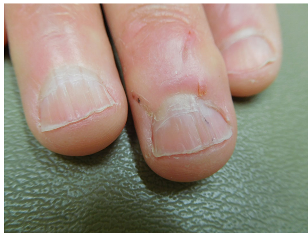
Fig. 6 Close view of the distal fingers of a man with chronic lymphocytic leukemia who is being treated with ibrutinib. There is trachyonychia with linear splitting of the nail; there is also horizontal splitting and shedding of the distal nail. A splinter hemorrhage is present on the middle fingernail. Talon noir, blood in the stratum corium, can be seen in the lateral nailfold of the middle finger

Ibrutinib is an oral, irreversible tyrosine kinase inhibitor. It affects neoplastic cells by covalently binding in the cysteine moiety in the active site of tyrosine kinase, resulting in subsequent inhibition of neoplastic cell proliferation, substrate adhesion, migration and survival [1, 3, 4].