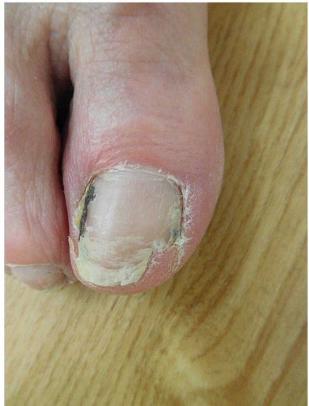
Fig. 3 Ibrutinib-associated changes of the distal right great toe and toenail in a woman with chronic lymphocytic leukemia. There is erythema of the proximal nailfold. The surface of the nail is rough and there are horizontal ridges. The distal nail shows fissures and splitting; the lateral portion has shed