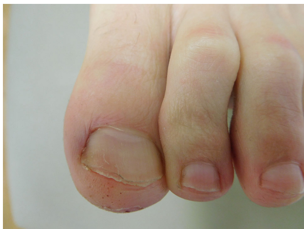
Fig. 7 The left great toenail of a 53-year-old man with chronic lymphocytic leukemia who is being treated with ibrutinib. There is koilonychia. The nail is fragile and brittle; there is horizontal splitting and shedding of the distal nail