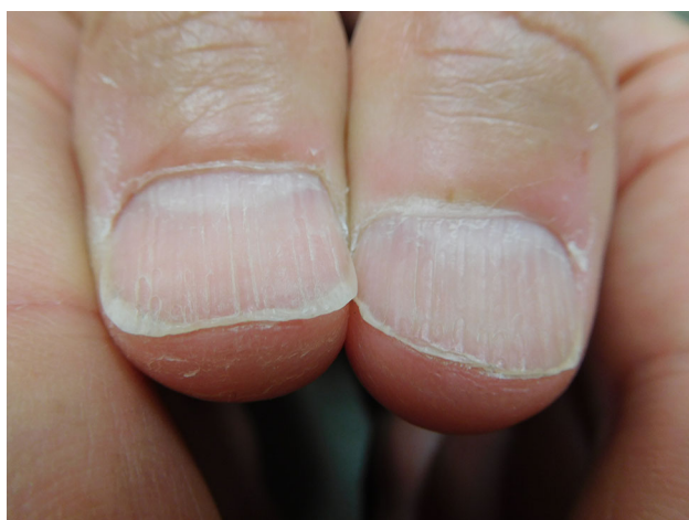
Fig. 4 Ibrutinib-induced nail changes in a 53-year-old man with chronic lymphocytic leukemia. There are longitudinal ridges. There is longitudinal and horizontal splitting of the nail. Distal shedding of the nail is also present. In addition, there is dermatitis of the tips of the thumbs with superficial desquamation

The first-line treatment for patients with chronic lymphocytic leukemia often includes a combination of chemotherapy agents and immunotherapy (anti-CD20 monoclonal antibody) [1–3, 5–7, 9, 10]. However, the age and comorbidities of the individuals being treated often limit the applicability of these standard treatments. [1, 2, 5–7, 11]. Ibrutinib is a new drug for the treatment of patients with chronic lymphocytic leukemia.