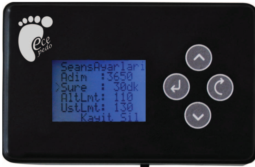
FIGURE 1. ECE PEDO: The session settings in the screen shows buttons of switching, recording and deleting to display lower limit, upper limit, number of steps, and walking time.

falling or exceeding the limits. If a person's walking speed falls below the target step range, it gives a warnings beep to speed up. If the person's walking speed is over the target step range, it gives a warning beep to slow down. Steps per minute can be adjusted by a health professional for each individual or the user can enter the general step recommendation like 100 \text{ step min}^{-1} . The pedometer starts the time after the patient reaches the specified number of steps. It is programmed to begin recording steps after 4 consecutive steps have been taken. The device beeps after the start and end of the determined session and a buzzer is used for alerts. This particular pedometer has power button, USB input, sound system, digital sensor connection, a belt clip and has the capability to store data of 20 sessions and how many steps were taken in how many minutes. It is charged via an USB port. Patent and trademark application was made for ECE PEDO.