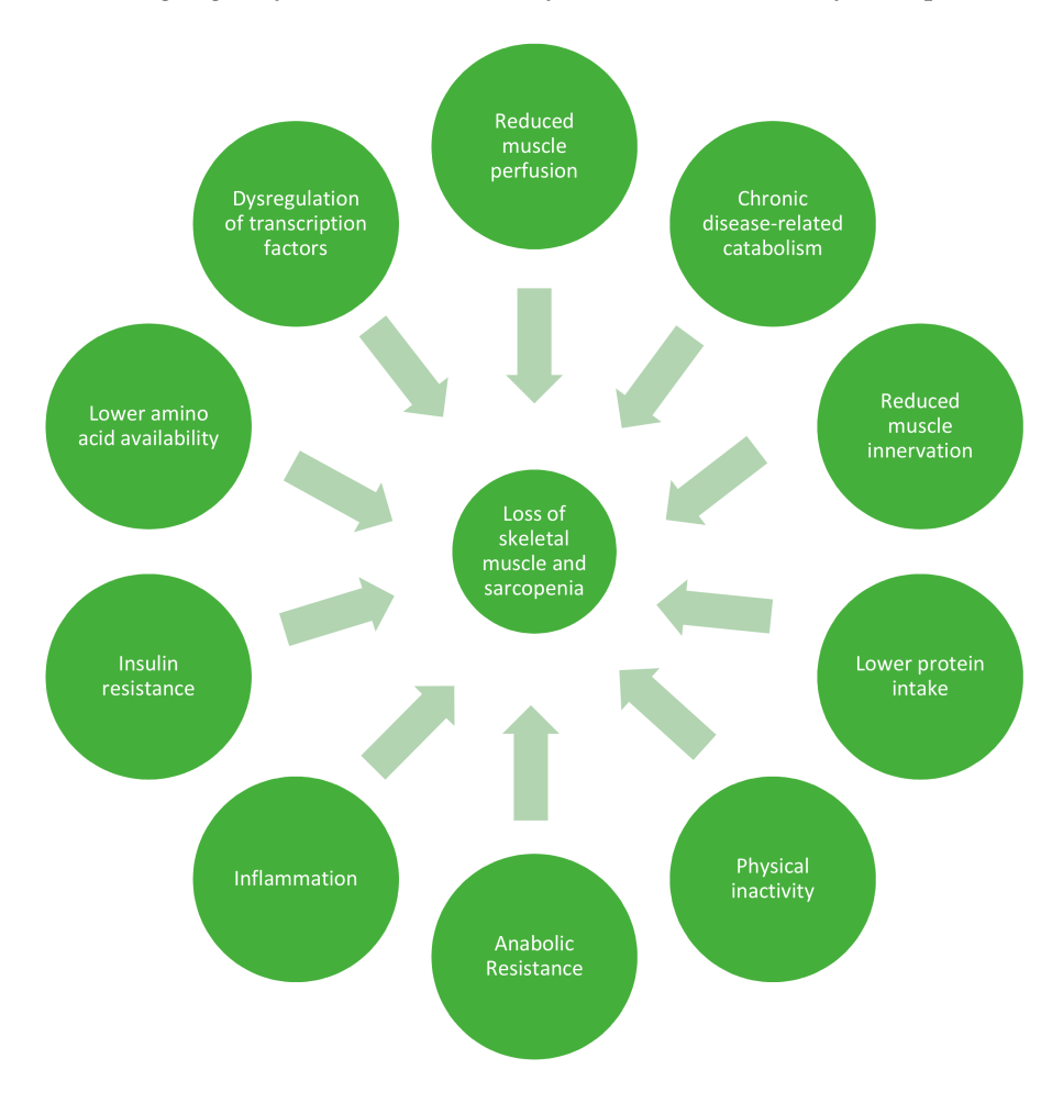
Figure 2. Factors leading to loss of skeletal muscle and sarcopenia in older adults.

Skeletal muscle mass is regulated by the processes of muscle protein synthesis and breakdown (MPS and MPB). MPS rates are largely controlled by responsiveness to anabolic stimuli, such as consumption of food, and physical activity. Catabolic stressors include illness, physical inactivity, and inflammation, of which the older population tend to have higher rates (Figure 2). Ageing does not seem to influence MPB to the same degree as MPS, and so much of the focus of the aging literature is on MPS [27,41–43]. Older adults have shown evidence of 'anabolic resistance', whereby a higher dose of protein is required to achieve the same MPS response as a younger person [1,28,39,40,44]. While this concept has been questioned, especially in the context of healthy older adults [45], it is now considered consensus that a higher recommended daily amount of 1–1.3 g/kg/day should be consumed by older people to offset catabolic conditions [1,46–49]. In the context of illness or injury, older adults may require as much as 2 g/kg/day, as recommended by the PROT-AGE Study Group [50].