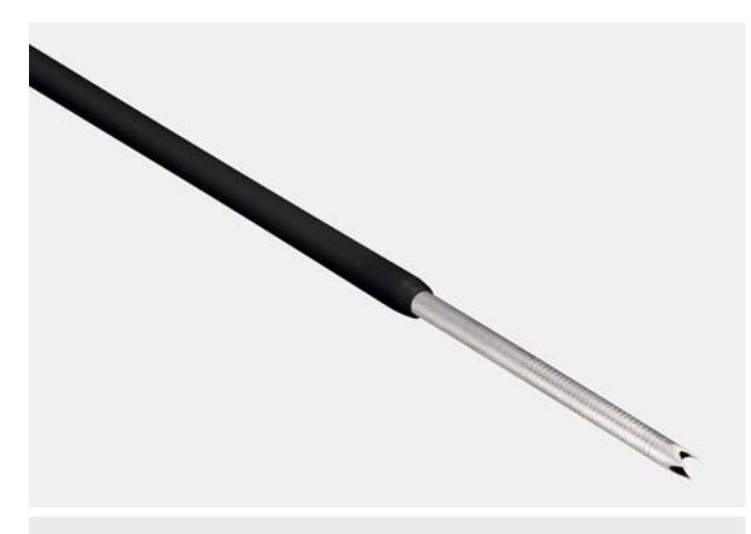
▶ Fig. 2 A 22-gauge Franseen needle with three tips for puncture.