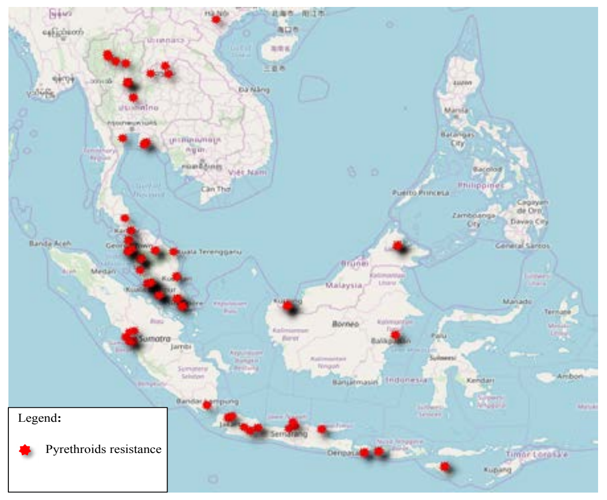
Figure 3 The Distribution of Pyrethroids Resistance Published from 2015 to 2019