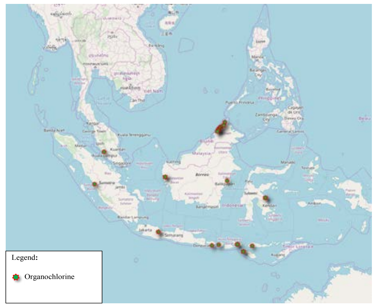
Figure 5 Organochlorine Resistance Based on Published Data from 2015 to 2019