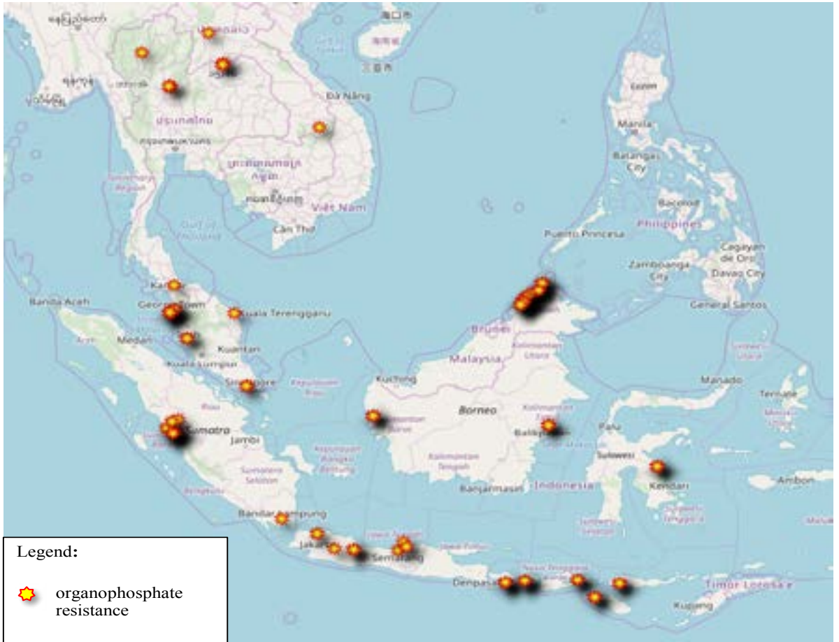
Figure 4 Organophosphate Resistance Based on Published Data from 2015 to 2019 African Health Sciences, Vol 21 Issue 3, September, 2021