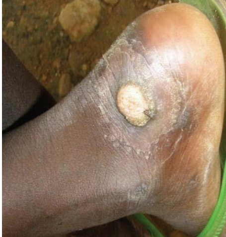
FIGURE 1: Papilloma.