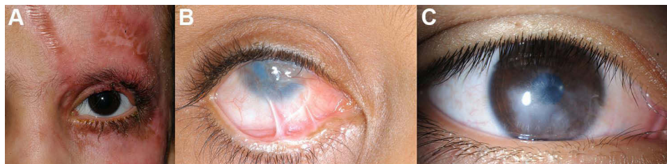
Figure 2 (A) External photo showing left side skin burn of a child as a result of a chemical burn. (B) Slit-lamp photo showing limbal stem deficiency with symblepharon formation secondary to a chemical burn. (C) Slit-lamp photo of the right eye revealing corneal opacity secondary to a chemical burn.

Our research study focussed on outcomes of ocular chemical burns in children over 12 years at a tertiary eye hospital. We observed that chemical burns occurred mainly at home. The main complications were corneal opacities, (LSCD), and symblepharon. The most common surgical procedures conducted were symblepharon release and (AMT). The outcomes of our study showed a decrease in the proportion of eyes with (SVI) after chemical burns, one year after management. The visual outcomes could be predicted by grading the chemical burns.