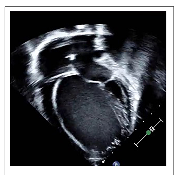
FIGURE 1 Two-dimensional, apical 4-chamber echocardiographic image depicting an enlarged ventricle with spherical geometry and bilateral atrial enlargement in a patient harboring dilated cardiomyopathy secondary to a pathogenic gene variant in the TTN gene.

Dilated cardiomyopathy is typically characterized by eccentric ventricular remodeling and decreased systolic function; and it can be detected in asymptomatic individuals, in those with heart failure symptoms, or in association with arrhythmias (Jefferies and Towbin, 2010) ( Figure 1 ). Globally, DCM is one of the most common forms of cardiomyopathy, and it represents a leading cause of cardiac transplantation in children and adults