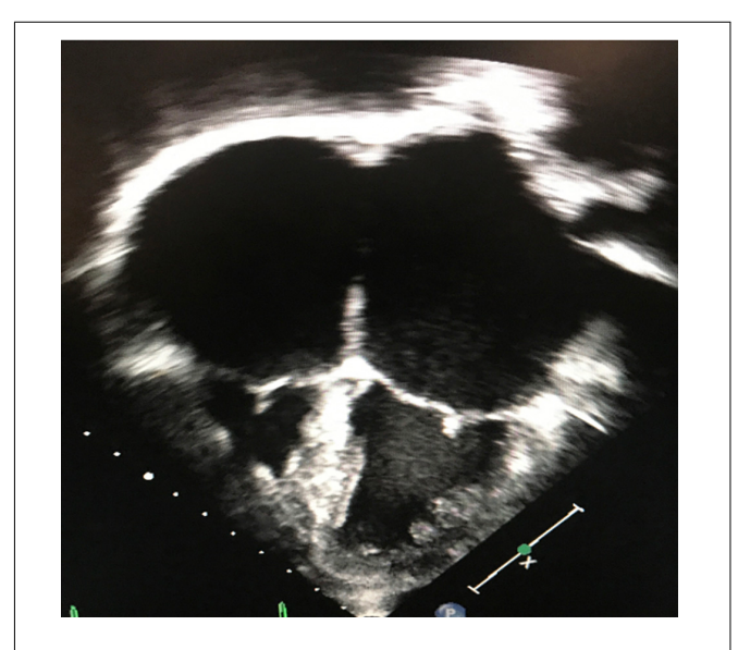
FIGURE 4 | Two-dimensional, apical 4-chamber echocardiographic image depicting small, restrictive ventricles and significant biatrial enlargement in a patient with restrictive cardiomyopathy.

The clinical presentation is heterogenous and it relies on the degree of the inability to accommodate adequate cardiac