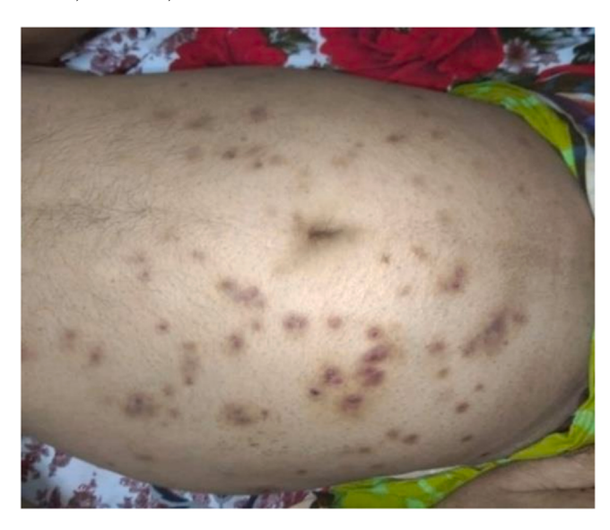
Fig. 1. Multiple skin lesions involving abdomen.