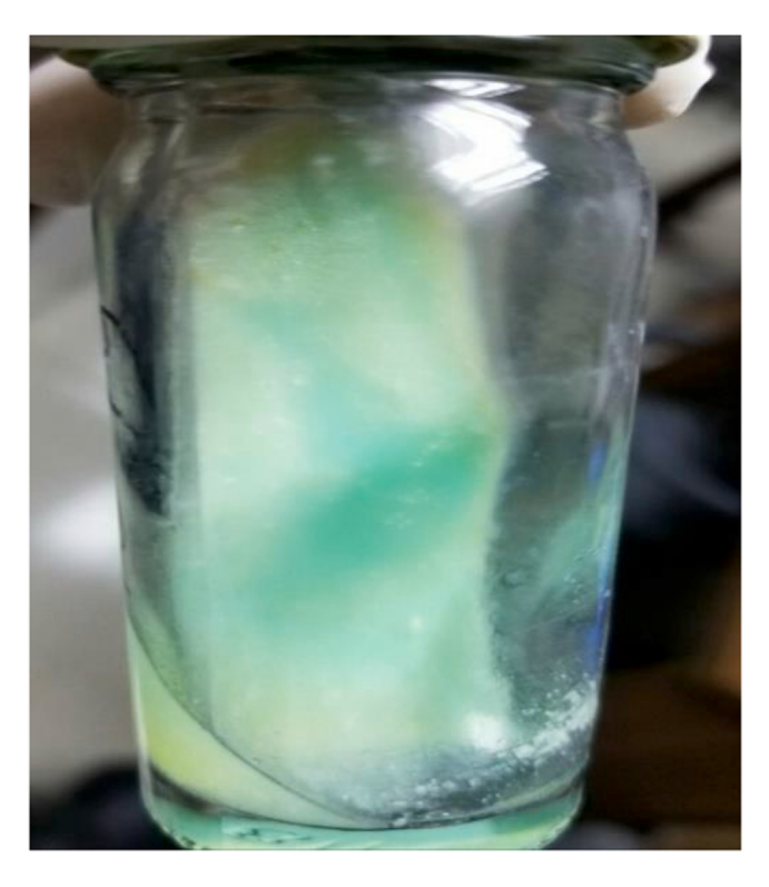
Fig. 4. Growth of MTB in MGIT from pus.

well above the normal range, measuring 227.05 mcg/day (Normal range: 50–190 mcg/day). Rheumatoid factor, anti-citrullinated protein antibody (ACPA) and HLA-B27 were negative with normal findings in plain X-ray and MRI of both SI joints. Early osteoarthritic changes were noted in plain X-ray of both knee joints.