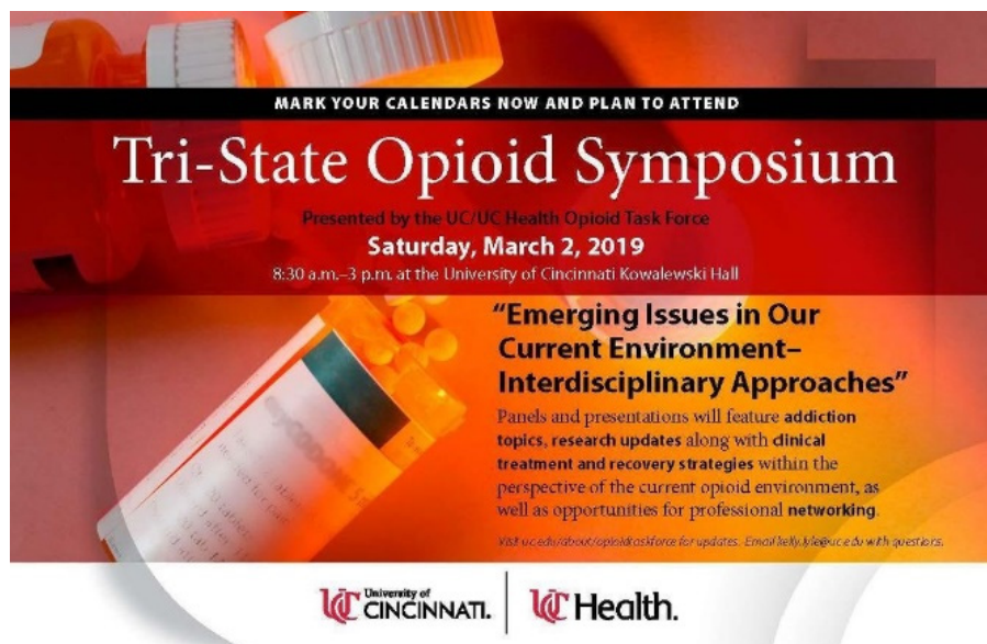
Figure 2. Flyer for the 2019 Tri-State Opioid Symposium.

College of Arts & Sciences engage undergraduate students in addressing the social implications of OUD as they provide job-readiness training at Cincinnati's Center for Addiction Treatment. Finally, task force members have played integral roles in the activities of local agencies and groups, including the HCARC, Cincinnati Exchange Project, and RecoveryOhio.