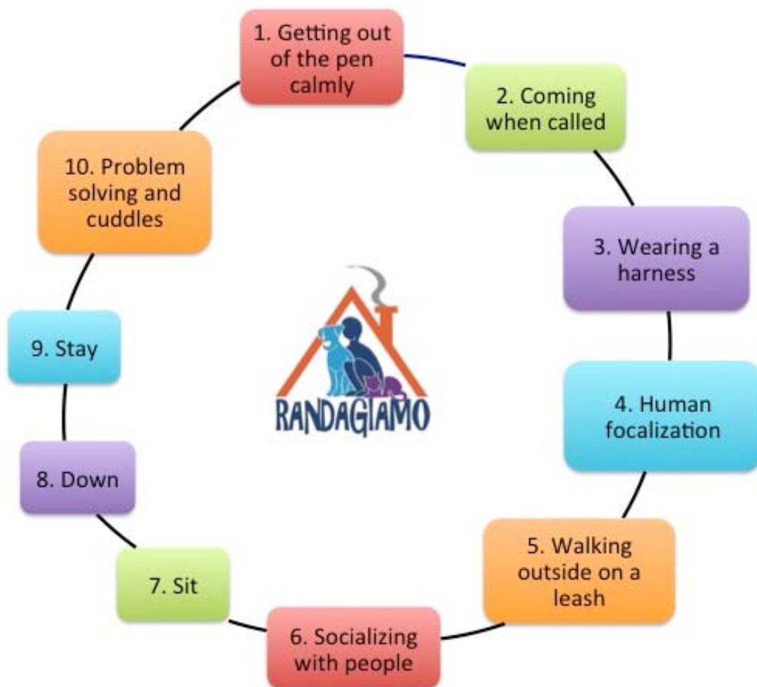
Figure 2. RandAgiamo training protocol: the 10 steps of each session.

The complete training protocol consisted of six sessions carried out over a period of two weeks (three sessions/week). Each session included a predefined series of 10 steps (training exercises): getting out of the pen when calm; coming when called; wearing a harness; human focus; walking outside on a leash; socializing with people; responding to commands “sit, down, stay”; problem solving and relaxing with cuddles (Figure 2). For each step, a maximum time of 5 min was allowed, with the exception of walking outside on a leash, which was up to 15 min. All the steps of the RandAgiamo operational training were planned and performed according to dog ethology and welfare principles. All dogs that completed all the sessions of the standardized training protocol were named “ RandAgiamo dogs ”.