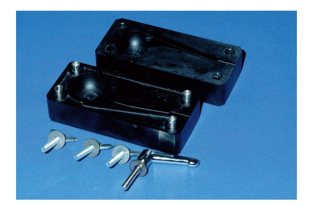
Figure 1. Mold, consisting of polyoxymethylene (POM), for standardized production of hip spacers. Each spacer has a head diameter of 50 mm, a stem length of 10 cm, and a total surface area of 13,300 mm<sup>2</sup>.

gentamicin/40 g cement) as bone cement has been shown to have elution characteristics that are better than those of other bone cements (Anagnostakos et al. 2006). For the spacer prosthesis and the acetabular component, production of 80 g and 40 g of polymethylmethacrylate (PMMA), respectively, is required. Depending on the identity of the causative pathogen and its sensitivity profile, we sometimes load the bone cement with a second antibiotic. In cases of an unidentified bacterium preoperatively or if the infection was revealed during an operation for presumed aseptic conditions, we routinelly use the combination of 1 g gentamicin/4 g vancomycin/80 g PMMA. Each spacer has a head diameter of 50 mm, a stem length of 10 cm, and a total surface area of 13,300 mm<sup>2</sup>. The acetabular component has an inside/outside diameter of 53/56 mm and a total surface area of 4,410 mm<sup>2</sup>. When there is to be a combination of antibiotics, the second antibiotic is added manually to the Refobacin-Palacos powder. After thorough