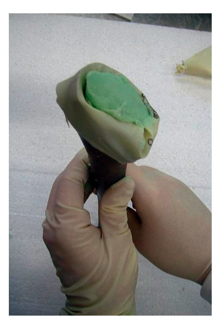
Figure 3. The antibiotic-loaded bone cement, consisting of the same mixture as the spacer, is introduced into the glove.