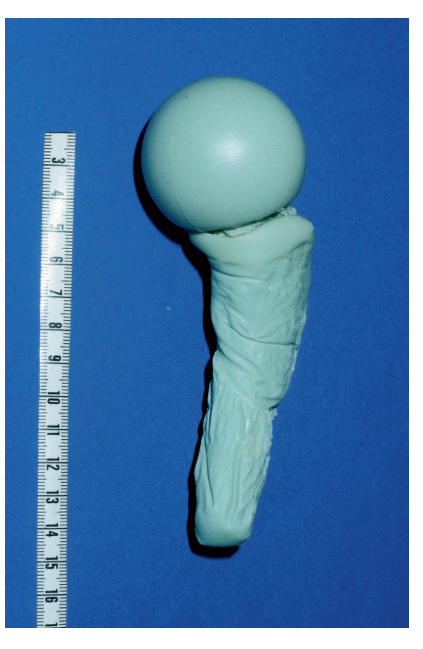
Figure 5. After removal of the glove, the cement mantle around the stem of the spacer shows an almost exact anatomical copy of the proximal part of the femur.

mixing, the cement's liquid monomer is added. After attaining a doughy state, the cement is then poured into the two halves of the spacer mold. The halves are then clamped together. After 15 min, they are opened again and the molded spacer is removed.