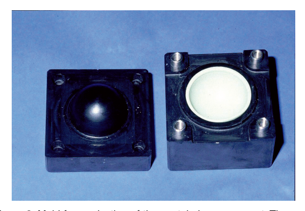
Figure 2. Mold for production of the acetabular component. The component has an inside/outside diameter of 53/56 mm and a total surface area of 4,410 mm<sup>2</sup>.

Open Access - This article is distributed under the terms of the Creative Commons Attribution Noncommercial License which permits any noncommercial use, distribution, and reproduction in any medium, provided the source is credited. DOI 10.3109/17453670903039551