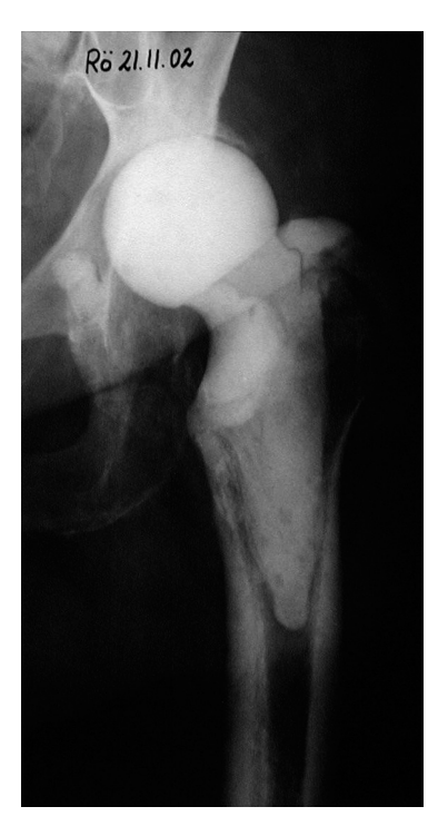
Figure 7. Articulating hip spacer fixed according to the "glove technique" in situ.

aimed for (< 0.73), and deep insertion of the spacer into the femur is recommended (> 57 mm). Magnan et al. (2001) and Duncan et al. (1993) described 1/10 and 3/13 dislocations, respectively, after implantation of a standardized spacer. On the contrary, Ries and Jergesen (1999), Koo et al. (2001), Shin et al. (2002), and Takahira et al. (2003) did not observe any spacer dislocation in their respective series.