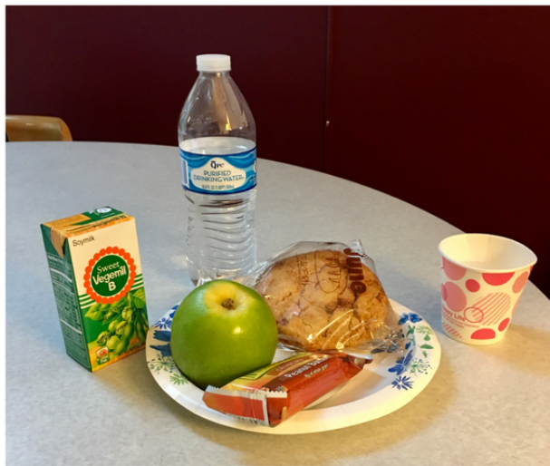
Figure 3. Food items used in the study.

During the test in the lab, each participant was asked to accomplish the tasks (ie, capturing, viewing, and transmitting images of food items) by interacting with FRADA (see Textbox 2). In order to answer RQ1 and RQ2, once participants completed the tasks, they were asked to fill out an after-scenario questionnaire (ASQ; see Figure 4), which is known to be a valid