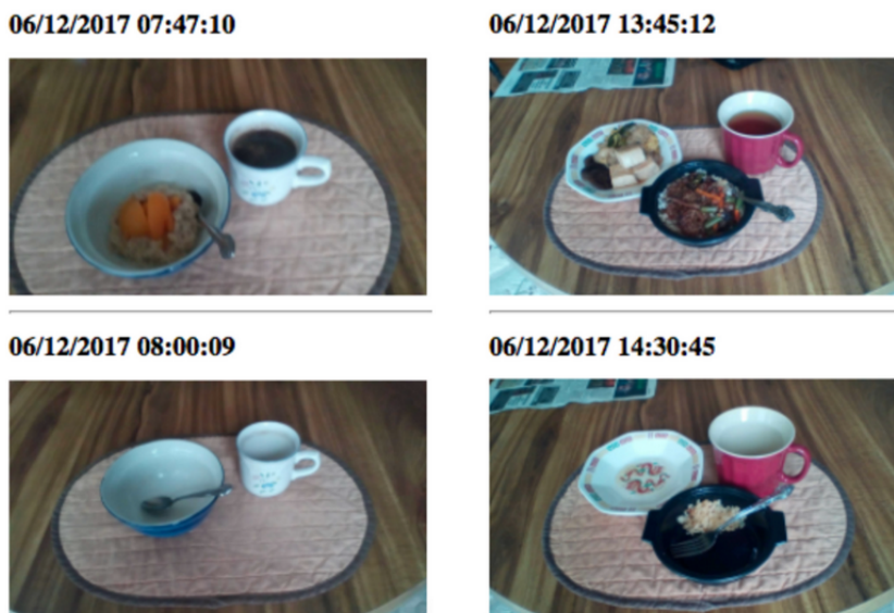
Figure 2. Screenshots of the user interface of the viewer app for reviewing images of food items during 24-hour dietary recall interviews.

dietitians and older adults with diabetes through devices (eg, laptops, tablets, or smartphones) during 24HR interviews. As Figure 2 illustrates, the app displays a series of images transmitted by each older adult participant with diabetes. The date and time information were added to the top of each image as metadata for the images. In particular, the app allowed users to navigate the images taken more recently by scrolling down the page, as images were organized in chronological order.