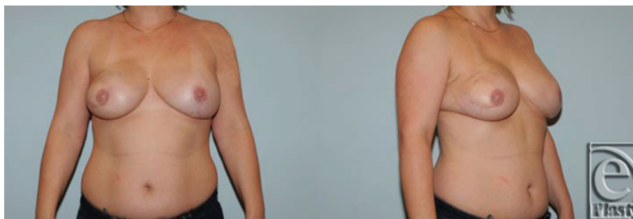
Figure 2. A patient after delayed reconstruction of right breast with latissimus dorsi myocutaneous flap.

Aesthetically, a pleasing outcome is obtainable with LDMF reconstruction when tissue expanders are employed (Figs 2 and 3). The advantage of this operation is that it is technically straightforward and hospitalization is an average of 2 days, which compares favorably with the TRAM flap. Transverse rectus abdominus myocutaneous also has an arguably higher rate of both overall complications and significant complications such as hernias, fat necrosis, etc. 25-28