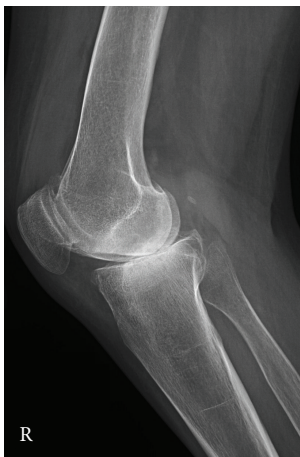
FIGURE 2: Lateral radiograph of the right knee. A small effusion is present as well.