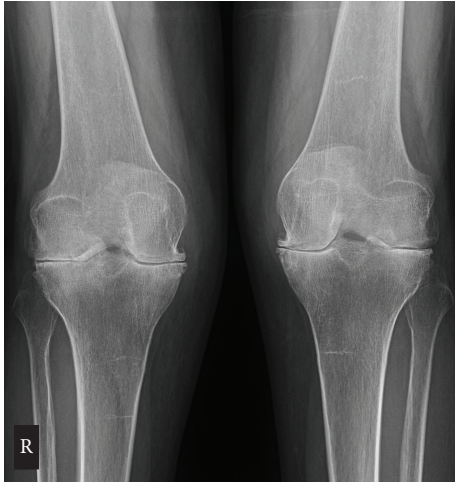
FIGURE 1: Posteroanterior radiographic view of bilateral knees demonstrating advanced arthritis. Note the valgus alignment to both legs. RA and OA radiographs differ in that RA radiographs will show periarticular erosions and osteopenia, whereas periarticular osteophytes, subchondral sclerosis, and joint space narrowing are more common in OA.