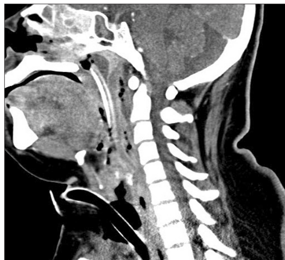
Fig. 2. Midline sagittal computed tomography section of cervical area shows that the tracheostomy tube is inserted into the trachea.