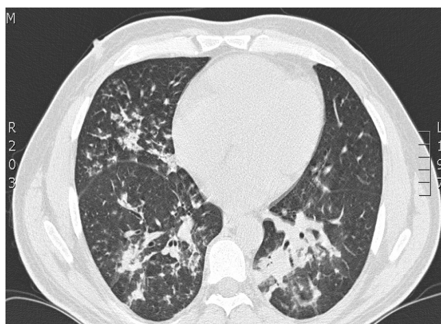
Figure 4. Computed Tomography of the lungs showing multiple nodules and ground glass areas