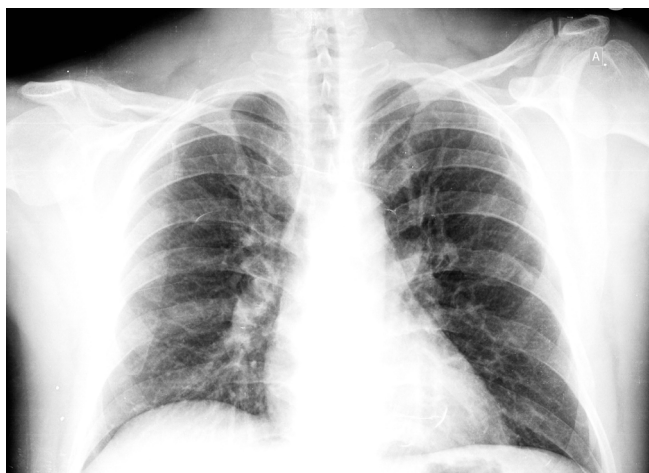
Figure 1. Chest x-ray on admission with no apparent findings.

Based on the initial clinical and laboratory findings as well as the symptomatology, infective agents should be excluded. Blood and urine cultures, tuberculin skin test and interferon- \gamma release assay, B and C hepatitis, HIV I+II test were all negative. Also, serological tests for syphilis, leishmaniasis, brucellosis, Epstein-Barr and cytomegalovirus were also negative. Chest x-ray (CXR) on admission had no apparent findings ( Figure 1 ). An abdominal ultrasonography and later a computed tomography (CT) of the abdomen confirmed the hepatosplenomegaly ( Figure 2 ). Electromyography was normal. A liver biopsy showed non-specific inflammation with no fibrosis. Upper and lower gastrointestinal examination revealed also non-specific findings, but a small intestine biopsy came back with results compatible with coeliac disease. Further serologic tests for coeliac disease (anti-tissue transglutaminase, endomysial and deamidated gliadin pep-