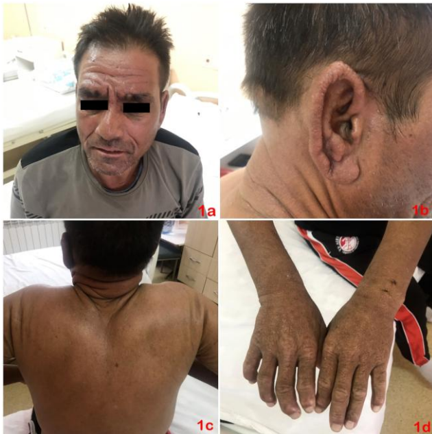
Figure 1: a) Hardening of the face skin; b) Skin-colored small papules on the ear skin; c) Hardening of the skin on the back and neck; d) Multiple disseminated papules on the skin of the hands and arthropathy

The patient was receiving treatment with insulin degludec 30 IU-0-0 and insulin aspart 10 IU-14 IU-14 IU, and for the past nine months, he received tenofovir disoproxil 245 mg (0-0-1) for treatment of chronic hepatitis B. The patient was hospitalized for swelling, pruritus and hardening of the skin on the face, ears and hands, which subsequently spread to involve the trunk. Skin complaints began 3 months after the start of therapy with tenofovir. Dermatological examination revealed significant thickening and hardening in the areas of the face, neck, body and extremities, and generalised lichenoid papules were also found (Figure 1a, 1b, 1c, and 1d).