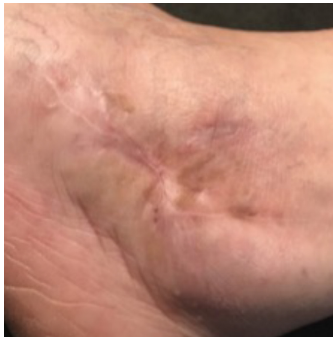
Figure 5 Complete resolution of pyoderma gangrenosum at the lateral malleolus several months after starting treatment with prednisone and adalimumab.

failure and therefore had to be discontinued again. Because the results with prednisone alone were insufficient, adalimumab injections were started (figure 5). Currently, more than a year after PG diagnosis, the patient has to use daily 3 mg prednisone and adalimumab injections two times per week to prevent recurrence of PG.