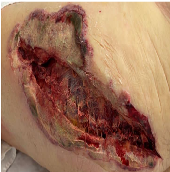
Figure 3 Picture of the left hip a few days after removal of the total hip arthroplasty, surgical debridement and starting with prednisone therapy. The wound edges are less irritated and erythema is reduced.

was planned to investigate the presence of an underlying inflammatory bowel disease. Unfortunately, the patient died from the consequences of COVID-19 before the interventions and further investigations could take place.