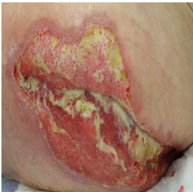
Figure 4 Improvement of the skin at the left hip 1.5 months after treatment with prednisone and infliximab.

Patient B: a few weeks after prednisone initiation, the skin was healed. Consequently, the dose of prednisone was reduced. However, this unfortunately resulted in increased activity of PG. Ciclosporin was added to prednisone, which at first showed a good clinical response. Unfortunately, it also caused kidney