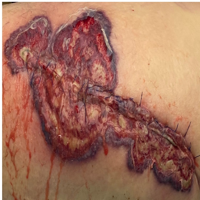
Figure 1 Ulcer around the operation wound on the hip with undermined blue-purple edges and peripheral erythema 3 days after debridement, antibiotics and implant retention procedure.