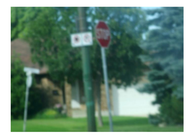
Figure 6. Image of stop sign submitted by youth participant.

That's the stop sign at the end of my street (Figure 6). And I just sort of thought like all of the times I feel like I'm just sort of standing and staying in one place, not really making progress in any field of my life ... so that sort of represents anxiety and depression ... . I'm not really happy being in that moment.