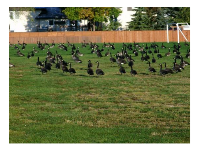
Figure 10. Photograph submitted by participant to represent anxiety over crowds.

difference between each person, only know if it's a person you don't know and that causes anxiety. So, using geese where they almost all look the same is kind of the best analogy of what it's like in the eyes of someone with anxiety in a crowd.