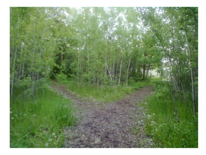
Figure 7. Image of pathways submitted by youth participant.

If you notice, there's two pathways ... So even though I'm going out to nature I feel better, as soon as I approached this almost like a fork right ... I start feeling anxious again .... Like what way do I take?... Which always represents me in life, there's, whenever I'm facing a decision it's one of the worst causes of my anxiety because the what if comes up .... What if I take the wrong path and get lost or, or end up you know causing more problems or you know this and that and you know so many things come up, even though it's such a beautiful scenery and it's supposed to make me feel good, it's just, I stood there going, which way, I mean even though it's no big deal, I'm just taking a walk, all of a sudden I just thought of wow, like anything that gives, makes me decide ... It just it feels horrible inside ... I hate deciding.