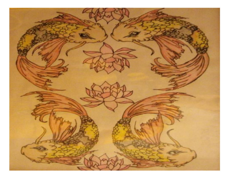
Figure 8. "Two sides of me".

At times my anxiety can be represented in a way by those sakura which is cherry blossoms .... And it can be to the point where I can't talk to people ... So there are times where I can approach someone and be with them and, and go about my daily things, but after that the cherry blossoms seem to push me away which is like the anxiety makes me feel like I want to get away from people and it's too much to handle and so it's just like its two sides of me (chuckle).