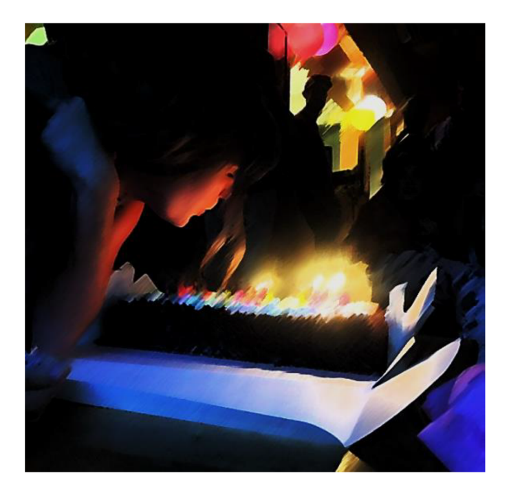
Figure 9. Image submitted by youth participant to demonstrate their anxiety over "being seen".

For other young people, there were times when they needed to be by themselves in part as an attempt to cope with their anxiety. They described feeling overwhelmed by the anxiety that came from navigating their social worlds, and how they would instead choose to close off to others. Photos were also submitted by young people to represent this shutting down to others. Many participants also submitted images of their phones as both a literal and metaphorical description of their anxiety and how it shaped their lived relations with others. For many youth, the telephone represented a source of their anxiety, and they described their fears of talking on the phone, but also the pressure they feel to constantly be connected particularly in the digital age. However, other youth also shared images of telephones more as a metaphor—to describe their fear of the unknown in the context of relationships—of not knowing how an interaction with others would play out and their anxiety of being around others.