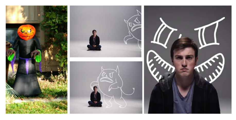
Figure 13. Anxiety as the Monster, as exemplified by a youth participant's photovoice submission and as interpreted in our film series.

The overwhelming nature of this anxiety was not always recognized by others who interact with youth with anxiety, including by those working in the healthcare and education system, as well as by family members and close friends. Despite their challenging lived experiences, there were many glimmers of hope for youth and demonstrations of their strength. Youth spoke about learning and educating themselves on their anxiety as well as ways to manage it so that they could more actively participate in their lives. An 18-year-old participant shared the following photograph (Figure 14) and description: