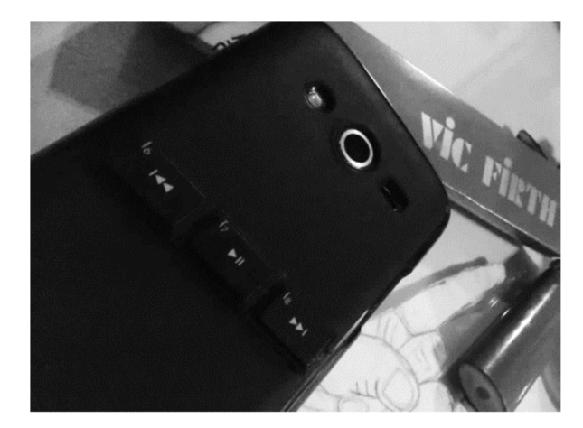
Figure 5. Play, pause, rewind, and forward.

Overall, youth participants with anxiety described their challenges living in the moment, and how they often were stuck living in the past, or worrying about their future, and as such lived with little enjoyment of the present. A 16-year-old participant included a photo (Figure 5) submitted as part of the photovoice process that referenced her challenges living in the present: