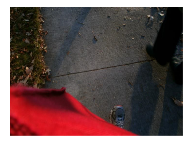
Figure 12. Image submitted by youth participant representing "small steps".