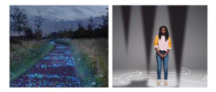
Figure 3. Participant's photovoice submission of a screenshot of a "lit path", alongside still from the film Fighting to Stay on the Path featuring the artists' interpretation.

This is a screenshot of a railway track with, with pebbles or flowers but some of it glows in the dark and I just thought the idea that like this path that you're on it can be surrounded by darkness and fear but if like the path itself is like lit and I don't know I just saw it as like no matter what is horrible or scary or that makes you fear yourself or others around you like as long as you stay on this path and you keep going it's like a beautiful journey and like as long as you keep going on the path it's going to keep you safe .... Cause that's what I see, like the path is the only thing that looks safe in this like field or that looks secure and it looks lit.