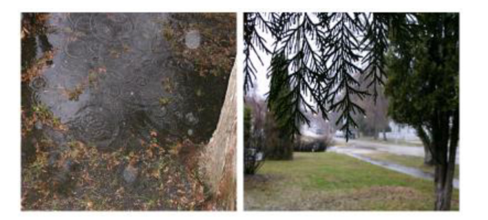
Figure 2. "Gloomy and grey".

With anxiety you kind of feel like it's always like rainy and gloomy and grey and just like, like with anxiety sometimes because it does, it can disable people to do things. Everything is just grey, and you can't see the sun and everything kind of sucks.