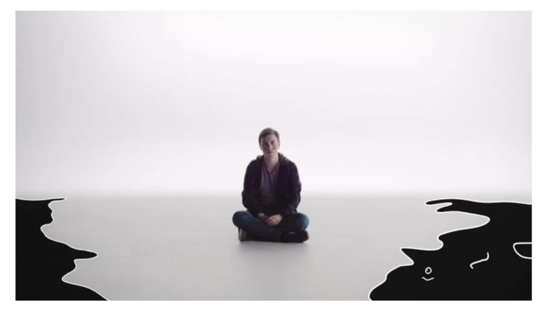
Figure 1. Still image of black sludge from The Monster, inspired by the above quote from a participant.

Anxiety is like lot of black sludge ... Like I see myself sinking a lot of the time. And that's a common image that I've looked at throughout my poetry ... I wrote about it in my journal and it's just a bunch of fears and stuff that I was upset about and really what anxiety and depression look like to me is just black sludge.