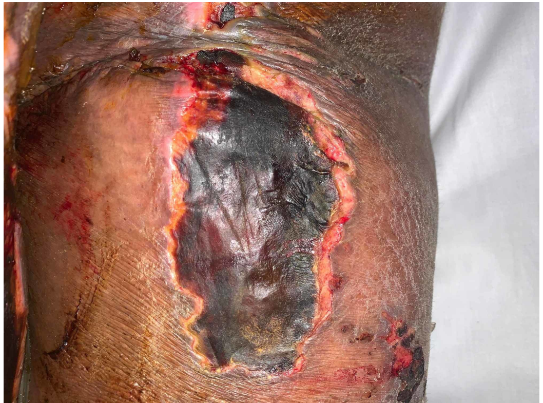
FIGURE 1: Ulcerated lesion with overlying crusted eschar involving the posterior right thigh.

Bullous lesions on the patient's sacrum developed into desquamating ulcerated plaques (Figure 2). Two annular lesions were found above the patient's right breast. Multiple superficial ulcerations with underlying hypopigmentation were found above the patient's left flank and the inferior region of the right breast. Multiple ecchymotic skin lesions were found along the upper and lower extremities bilaterally.