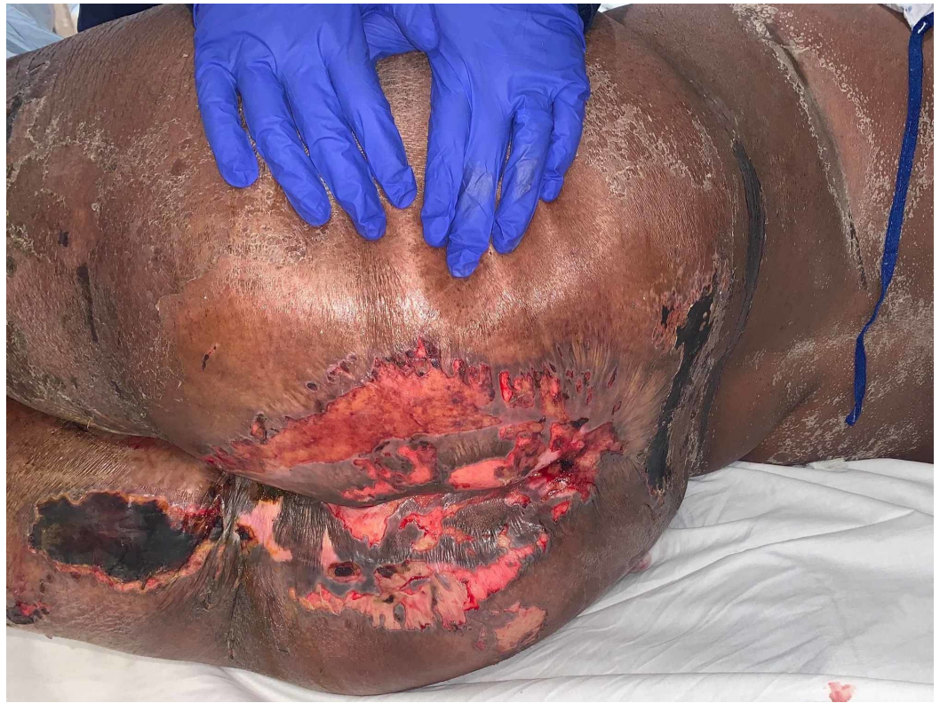
FIGURE 2: : Flaccid ulcerations due to skin breakdown. Hypopigmentation can be appreciated along the left midback region.