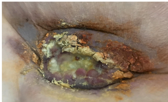
Fig. 1. Lesion located on the right flank, which extends towards the dorsal region, with measurements of approximately 6 \times 5 cm, with irregular borders, poorly defined, with abundant fetid discharge, which caused a lot of pain.

The incidence of metastatic abdominal wall lesions is approximately 0.7–9%, direct invasion and tumor implants in the abdominal wall can be due to tumors of various types and locations. The most common causes of metastasis in the abdominal wall is metastases of neoplasms of colonic origin, gastric origin, and in some cases and with the emergence of laparoscopic surgery, incidence of metastases