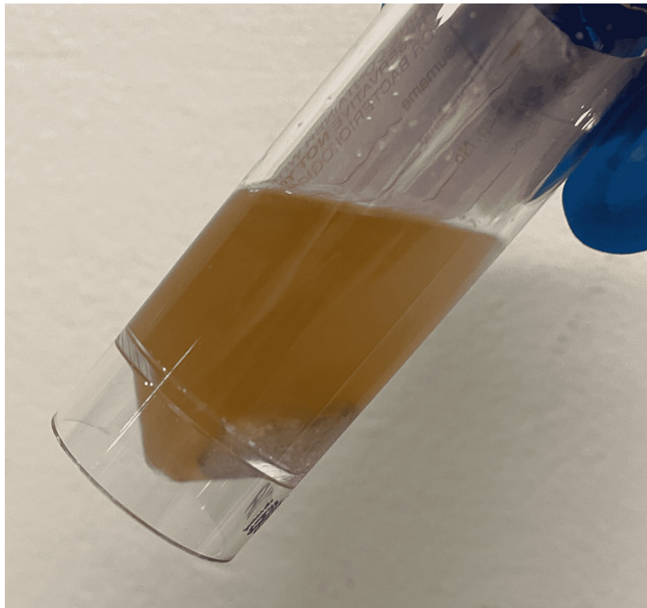
FIGURE 2: Urine sample from the catheter bag.