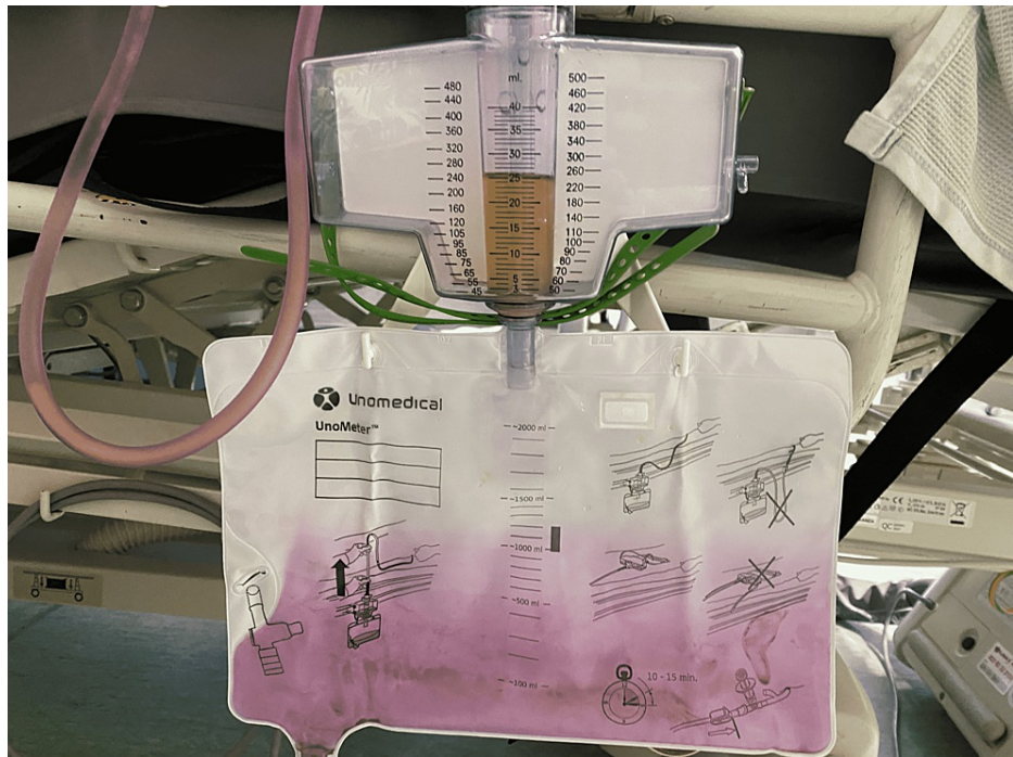
FIGURE 1: Purple-stained urinary catheter bag.

The patient denied any classical urinary tract symptoms, specifically: dysuria, suprapubic pain, or urgency, though she had a background of mild cognitive impairment. There were no catheter-associated complications such as overflow or leaking. However, clinical examination revealed marked suprapubic tenderness. Her chart was reviewed and there had been no recent changes to medication. A urine sample, with noticeable sediment/pus (Figure 2), was sent for microscopy, culture, and sensitivity (MCS). The catheter was removed. Blood tests revealed elevated inflammatory markers with C-reactive protein of 57 mg/L (normal 0-5 mg/L) and white cell count of 14.5 \times 10^9/L (normal 4-10 \times 10^9/L ) and she was treated for a UTI with empirical antibiotics (ciprofloxacin). MCS later revealed Proteus species with a white cell count of 273 \times 10^6/L (normal 0-40 \times 10^6/L ). The patient responded well clinically, had a meaningful improvement in her cognitive status, and was discharged from the hospital about 24 h later.