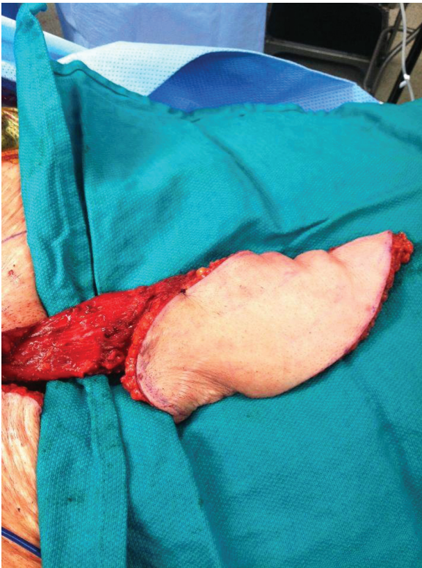
Figure 2: Intra-operative photo of VRAM harvest.

A standard VRAM was harvested from the abdominal wall. The bowel and abdominal contents were then returned to the abdominal cavity. Several Fastin Mitek brand (Raynham, MA) bone anchors were placed in the bones surrounding the pelvic outlet, including the fecal promontory, pubic tubercle and pelvic rim (Fig. 3). Holes were pre-drilled after the bone had been exposed. The anchors were then screwed into place with suture attached. Care was taken not to injure the ureters, sacral venous