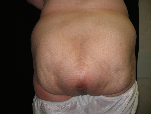
Figure 1: Posterior view of the patient upon initial presentation. There is a large bulging area where the APR was performed. The hernia was soft and reducible.