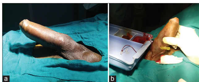
Figure 1: (a) On examination, the penis was rigid and firm in consistency (b) immediate aspiration from cavernosa using 16G needle showed minimal deoxygenated blood

The majority of the cases of priapism are idiopathic (46%), alcohol and drug-related (21%), perineal trauma (12%), sickle cell anemia, and hypercoagulable state-related (11%). [2] In the immediate management of priapism, it requires