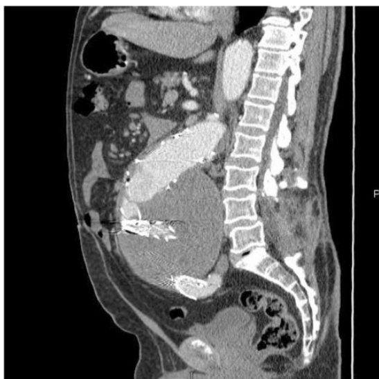
Figure 2. Sagittal CT angiogram of abdomen demonstrating mechanical fragmentation and displacement of stent.