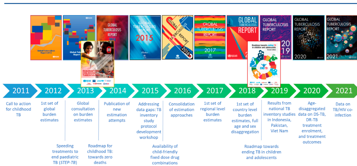
Figure 1. Global milestones related to TB in children and adolescents, 2011–2021 (Reproduced/translated/adapted from “Global TB Report 2021. Geneva: World Health Organization; 2021. Licence: CC BY-NC-SA 3.0 IGO [1]).

old), described further below. To track progress towards these goals, high-quality data are essential.