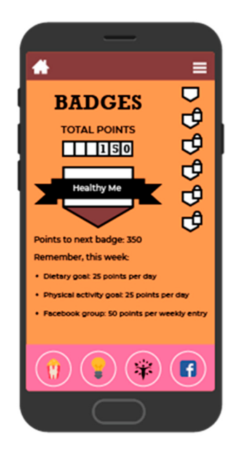
Figure 4. Screenshot of badge and point system.