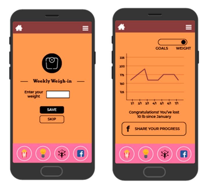
Figure 2. Screenshot of weight tracking and feedback.