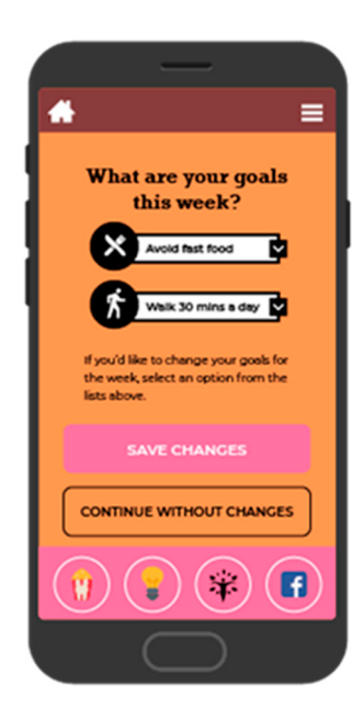
Figure 3. Screenshot of goal setting.