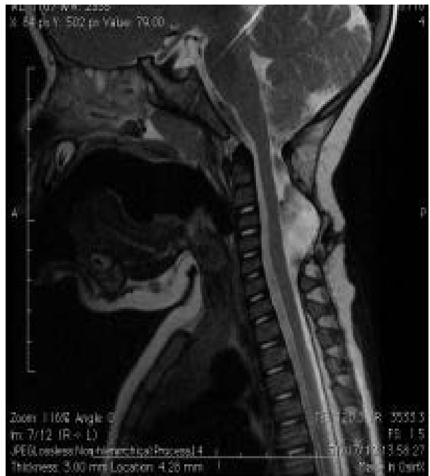
Figure 3. Postoperative cervical sagittal T2-weighted magnetic resonance imaging shows a hyper intense cystic mass, but does not show hydromyelia or tethering.