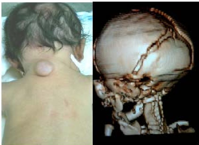
Figure 1. A small posterior cervical meningocele with a thicker skin and the corresponding preoperative 3D computed tomography scan, showing laminar defects near the neck of the meningocele.

In this particular, in the literature review, we found hydrocephalus in 4 out of 9 cases, required a ventriculoperitoneal (VP) shunt (as our case, mentioned above). Furthermore, 2 patients were shown with Chiari malformation, but no reports of posterior fossa craniotomy were reported as necessary. All patients were children although some adults' cases had been reported in other kinds of spine cystic dysraphism. The median age of 7 months (range 2 weeks - 8 years) was found and the male to female rate was 4:6. In most of the cases, the neurological examination was nor-