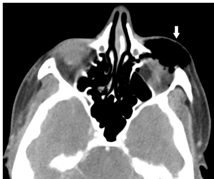
Image 2. Computed tomography shows subcutaneous emphysema around the left orbit (arrow).