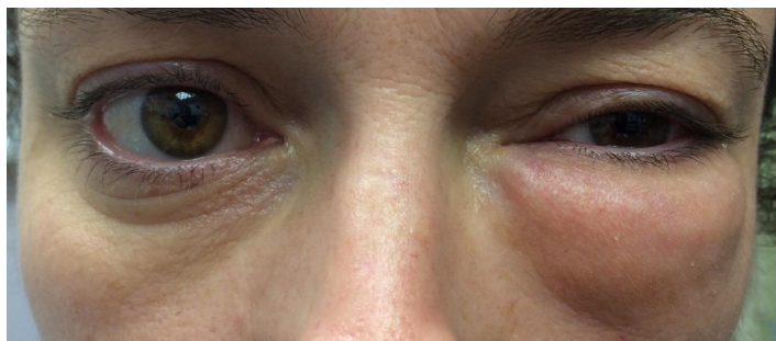
Image 1. Non-tender left periorbital swelling.

In conclusion, emergency physicians should consider nontraumatic orbital fracture in patients with orbital emphysema with no history of trauma. CT is the recommended study of choice.