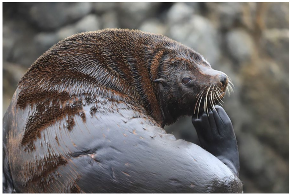
Fig. 1 South American fur seal ( Arctocephalus australis ) sighted at the Punta Curaumilla breeding colony on March 02, 2020. Photo credit: L. René Durán. Image freely available to use

survey, 228 individuals were registered, with the largest numbers in Punta Paquica ( n=40 ) ( 21^{\circ} 54' S ) and Roca Abtao ( n=93 ) ( 23^{\circ} 05' S ), but also notably observed at Punta Comache ( 21^{\circ} 11' S ) and Punta Patache ( 20^{\circ} 51' S ) [10] (Fig. 2). The establishment of new SAFS colonies in northern Chile was presumably due to the animals' need for food [10–16]. Moreover, while the abrupt decline in the effective population size of SAFS after the 1997–1998 ENSO event, in the year 1999 on the coast of Peru, was associated with greater mortality rates [15], it also coincided with a previously reported increase in the abundance of this species in northern Chile, with a total of 1600 individuals in the breeding season of 1996, with Punta Ballena ( 25^{\circ} 49' S ) as the southernmost locality of the described distribution [3, 17] (Fig. 2). Additionally, in the summer season of 2007, Bartheld et al. [8] reported the presence of 17 SAFS in Isla Chañaral ( 29^{\circ} 02' S ), which was the southernmost colony of the Peruvian subspecies (Fig. 2). Interestingly, we can also report that SAFS individuals had already entered the gap in its southernmost zone [4, 18, 19]. This suggests a colonization in both directions, with Isla Mocha ( 38^{\circ} 25' S ) representing the northernmost colony of the southern Chile/Atlantic unit, and the aforementioned Isla Chañaral in northern Chile representing the Peruvian/northern Chile unit.