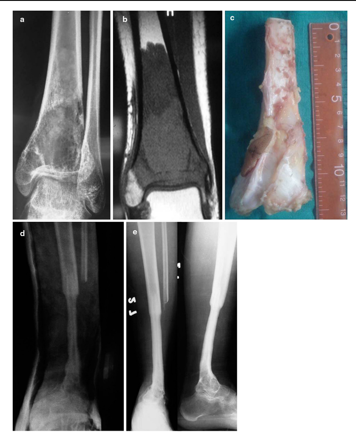
Fig. 1 a Radiograph showing osteosarcoma of the distal tibia in a 22-year-old male, b MRI of the same patient, c resected distal tibia, d X-ray at 8.5 months follow-up, e X-rays at 54 months follow-up showing hypertrophy of the fibula

infection, inadequate soft tissue coverage and talar collapse [4, 23]. Abudu et al. [4] in their series of endoprosthetic replacement reported rapid deterioration in a patient's ultimate outcome despite good initial functioning. Natarajan et al. reported a secondary amputation rate as high as 50 %