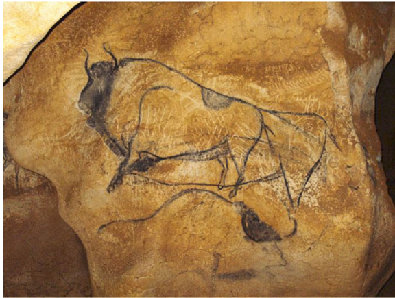
Fig. 1. Cave paintings in Chauvet-Pont d'Arc, Ardèche, France, supposed to show a wisent (upper painting) and a steppe wisent (lower painting), respectively. Both paintings are dated at around 36 kya.

the oldest samples dated more than 50,000 years ago. Massilani et al. [1] obtained 43 mtDNA control region sequences and 16 complete mitogenomes. Soubrier et al. [2] present sequences of 65 control region sequences and 13 complete mitogenomes as well as nuclear DNA sequences for 13 samples, accomplished by capturing 10,000 flanking sequences of SNPs from the Illumina 50K SNP panel.