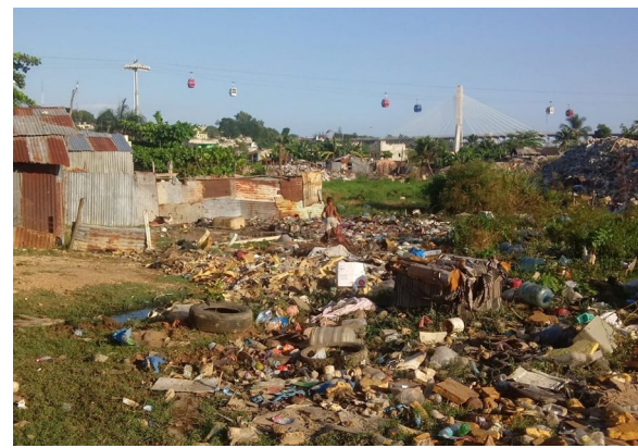
Fig. 2 Scene within Las Lila with metro system cable cars overhead and Rosario Sánchez bridge in distance

Two-fifths (39%) of interview participants said that asymptomatic malaria infection was possible, usually understood from personal experience or word-of-mouth.