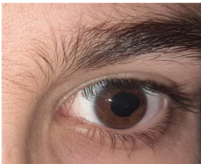
Figure 2 Shows lateral temporal iris coloboma in the left eye of the patient.