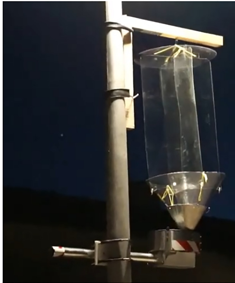
Fig 1. The automated insect trap mounted on a street-light pole. While the commercially available transparent flight-interception trap remains unmodified, the insect sampling unit is optimized: a turntable containing seven cups is rotated by a stepper motor fed by a rechargeable battery. The seven cups contain a liquid (e.g. water with/without biocide) and collect insects during seven user-defined time intervals (e.g., nights).

https://doi.org/10.1371/journal.pone.0229476.g001