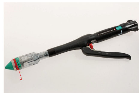
FIGURE 2: CPH34 HV.

described [13]. Clinical follow-up consisted of outpatient visits that were scheduled at six and 12 months after the operation, as soon as the complete healing was achieved. Residual prolapse was defined as the reduction, without disappearance, of prolapsed tissue (haemorrhoids and/or rectal prolapse) within six months after the operation; recurrent disease was defined as the reappearance of prolapsed tissue after a symptom-free period of at least six months. Each patient gave his/her written informed consent and the study protocol was submitted to the Ethic Committee approval. All patients underwent clinical examination six and twelve months postoperatively in the outpatient clinic.