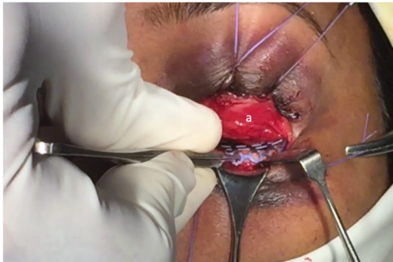
FIGURE 2: Picture of the turnover flap (a) providing excellent protection to the cornea and sclera during implant placement and fixation.