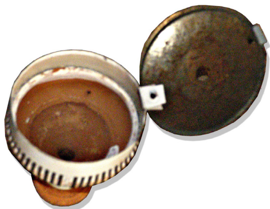
Figure 4 Hookah Bowl (chilam) from Pakistan. It is filled with up to 2 chattaks of a tobacco-molasses mixture (i.e. the tobacco weight equivalent of up to 60 cigarettes). Originally published in Chaouachi K : Tout savoir sur le narguilé; Paris, Maisonneuve et Larose, 2007, 256 pages.

allows the user to inhale the smoke, which has bubbled through the liquid.