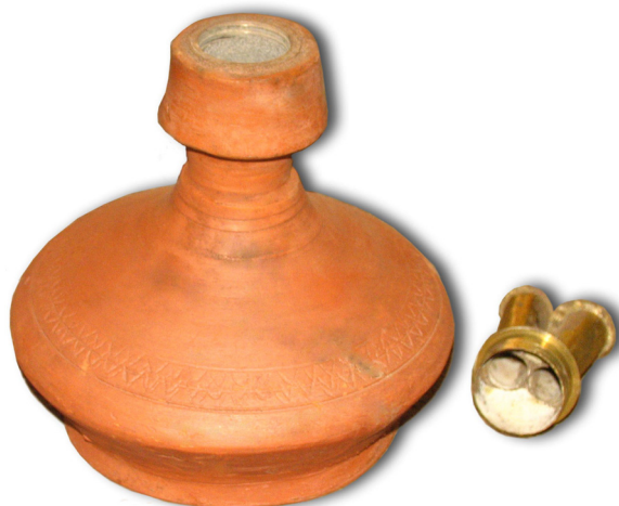
Figure 5 Hookah Base from Pakistan. Originally published in Chaouachi K : Tout savoir sur le narguilé; Paris, Maisonneuve et Larose, 2007, 256 pages.

Carcinoembryonic antigen (CEA; a family of glycoproteins, MW~175000-2000 Daltons) was first identified in 1965 by Gold and Freedman in human colon cancer tis-