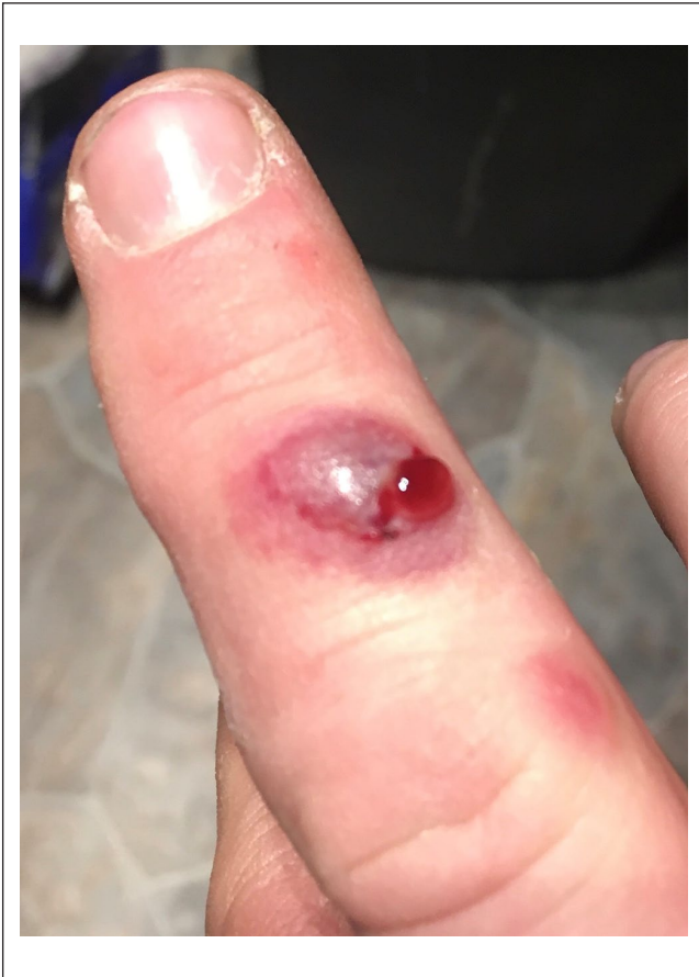
Figure 1. Milker's nodules on right hand. Acute weeping nodule and papulonodule.