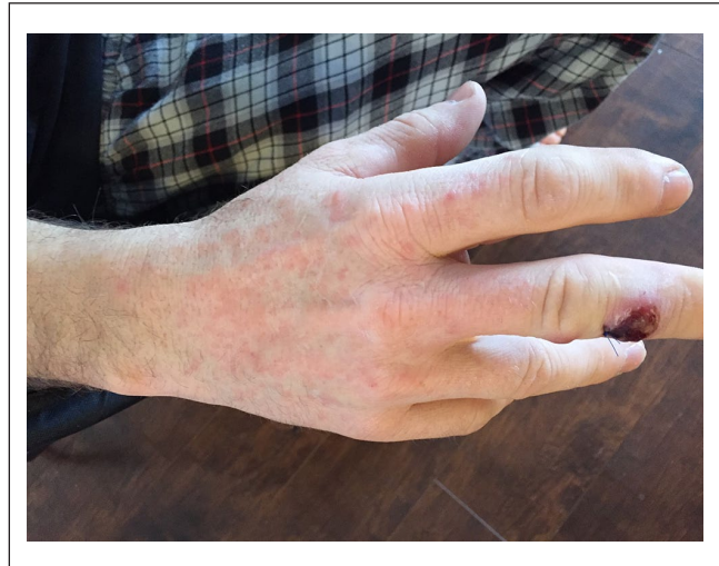
Figure 3. Papular erythema.

His doxycycline was discontinued, and both the eruption and lymphadenopathy resolved 1 week later.