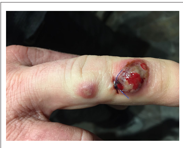
Figure 2. Milker's nodules, post-punch biopsy.

His doxycycline was discontinued, and both the eruption and lymphadenopathy resolved 1 week later.