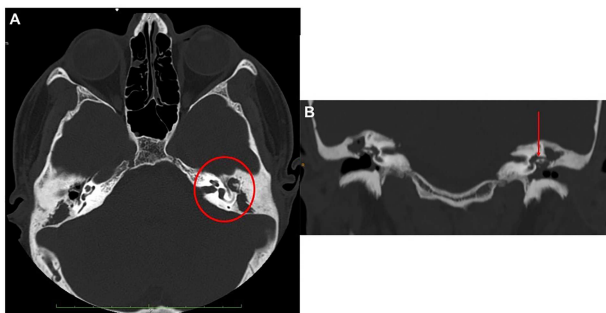
Figure 3: Ear CT scan; (A) axial view; the red circle shows the middle ear filled with inflammatory tissue, with erosion of the ossicular chain; (B) coronal view (the red arrow shows the erosion of malleus and incus); the malleus is not lateralized.

The inspection of the middle ear revealed the erosion of the ossicular chain without lateralization of the malleus, and presence of keratinizing squamous epithelium, confirming the CT findings.