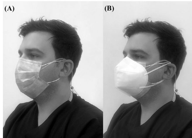
Figure 1. Demonstration of a subject wearing medical mask and medical mask plus type II filtering facepiece (FFP2) respirator. (A) Subject wearing medical mask at the first measurement ( T_0 ). Nasal prong inserted under the mask. (B) Subject wearing medical mask plus FFP2 respirator at the second measurement ( T_1 ). Nasal prong inserted under the mask.

We noted descriptive data, such as comorbidities, COVID-19 history, and smoking status at T_0 . We evaluated the intensity of subjects' dyspnea by using a 10-cm-long visual analog scale (VAS) chart (0 = no dyspnea; 10 = extremely strong dyspnea) at T_0 and T_1 . We also asked subjects whether they experienced fatigue, muscular weakness, headaches, drowsiness, or other symptoms at T_1 .