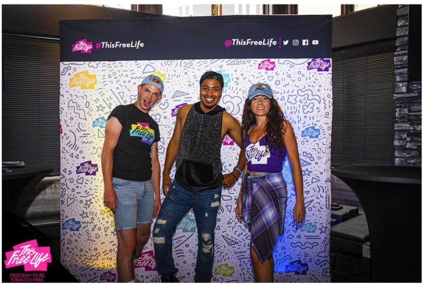
Figure 1. Sample This Free Life advertisement and event image.

Perceived normative trends. Perceived normative trends for LGBTQ+ young adult smoking was measured using a mean score of 2 questions, each on a 3-point scale: "Thinking about LGBTQ+ people your age, do you think tobacco use is..." (0) increasing, (1) staying the same, or (2) decreasing, and the question, "Compared to 1 year ago, people your age at LGBT bars, clubs, and events are smoking..." (0) more often, (1) about the same, (2) less often. Unlike traditional descriptive norms,