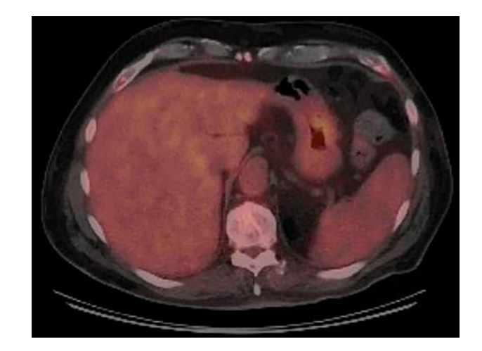
Figure 2. End of treatment PET demonstrating resolution of previously seen FDG uptake and overall positive response to therapy.

other nodal or extranodal presentations of DLBCL have been reported in the population of MS patients treated with natalizumb. In other treatment groups, an individual with Crohn's disease was diagnosed with DLBCL over 6 months after completing natalizumab therapy.<sup>6</sup> PCNSL and one case of peripheral T-cell lymphoma have both been described in patients with MS receiving natalizumab.<sup>7,8</sup> Interestingly, the majority of reported cases had no identified EBV-driven etiology. Studies have shown that patients with MS do not have a predilection for the development of NHL.<sup>9</sup>